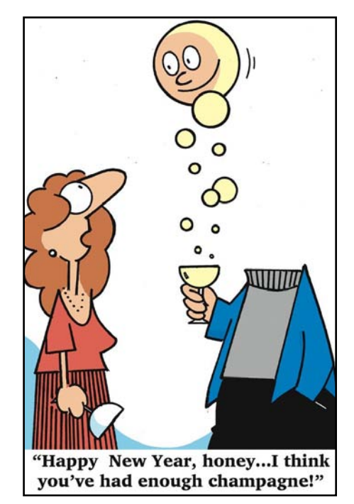
31 December, 2022 / 01 January, 2023 • Page 2